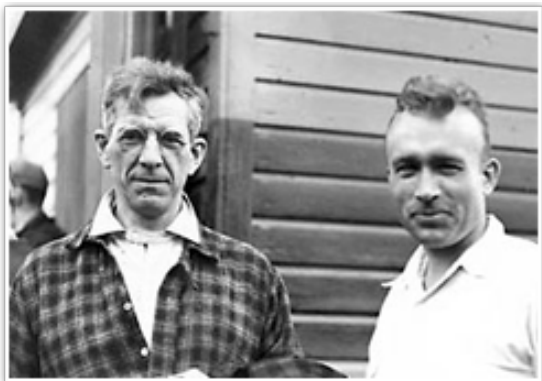
Benton MacKaye and Myron H. Avery

The October 1921, publication of "An Appalachian Trail: A Project in Regional Planning" in the Journal of the American Institute of Architects is almost universally seen as the moment of birth for the Appalachian Trail. Benton MacKaye was a former forester, government analyst, newspaper editor; and at the time, intermittently employed as a regional planner. He proposed, as a refuge from work life in industrialized cities, a series of work, study and farming camps along the ridges of the Appalachian Mountains, with a trail connecting them, from the highest point in the North (Mt. Washington in New Hampshire) to the highest in the south (Mt. Mitchell in North Carolina).